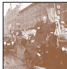
President Teddy Roosevelt rides down 17th St. in an open car during his visit to Denver (around 1918).

In these early years, the staff members were volunteers who gave their time and resources to try to build a network of support services for the hearing impaired. These respectable citizens were dependable, well-placed Denver citizens - housewives, husbands, business and civic leaders who were, more often than not, taking on a cause that meant something to them - that was close to their own hearts. Perhaps their children were struggling in school with speech delays or their aging parents were suffering profound hearing loss. Today, we are a staff of certified professionals helping over 8,000 children and adults with their hearing and language/literacy issues with our cutting-edge therapy options and compassionate audiology services.